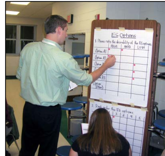
Right: A group representative records his responses at the end of the community dialogue