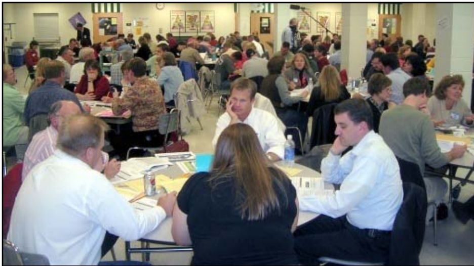
Left: A group discusses the questionnaire at the community dialogue

For each question, individual and group responses are tallied separately, and a summary of those results is included. Additionally, a summary of the individual and group comments is included, as well as all comments.